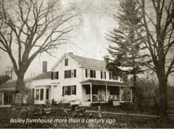
Bailey farmhouse more than a century ago