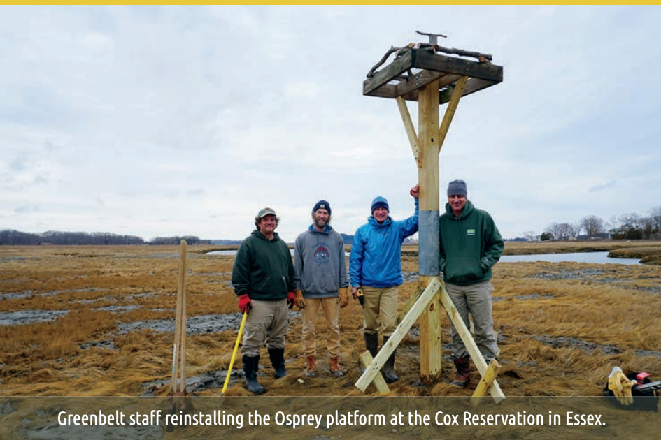
Greenbelt staff reinstalling the Osprey platform at the Cox Reservation in Essex.