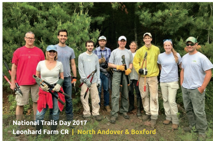
National Trails Day 2017 Leonhard Farm CR | North Andover & Boxford