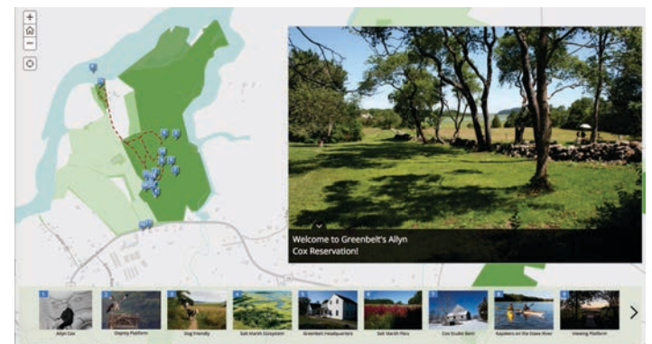
Allyn Cox Reservation | Essex

Browse photos, history, features, events