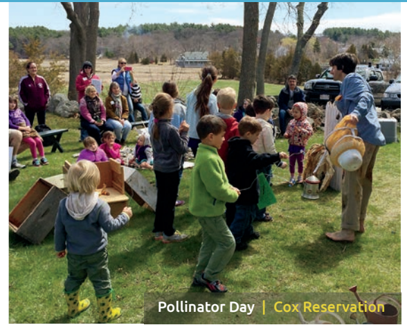
Pollinator Day | Cox Reservation

Weather permitting there will be an introduction to the Cox Reservation bees with a hive opening and honey extraction demo.