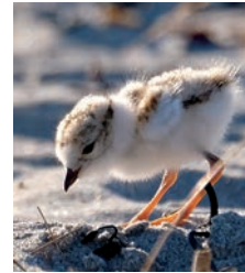
KIM SMITH KIMSMITHDESIGNS.COM

Grassroots movements may begin as small and at the hyper-local level, but they bring public attention to regional concerns. We saw this in action on Good Harbor Beach last summer, as our Land Stewardship crew helped protect exposed plover nests from danger. A passionate crew of citizens banded together to serve as plover wardens,